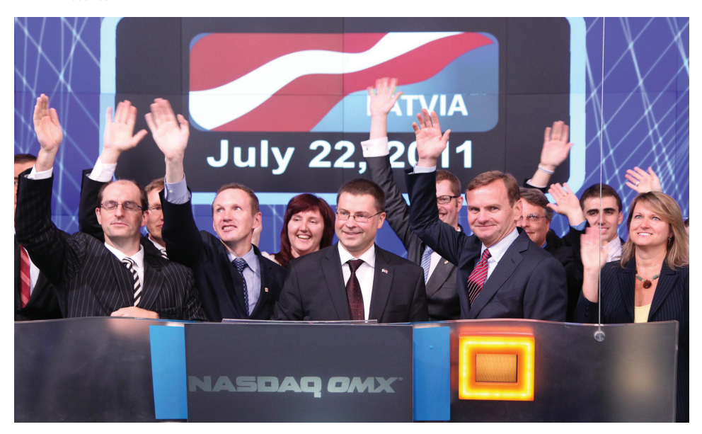
The Prime Minister the Republic of Latvia Valdis Dombrovskis at the NASDAQ working day's closing bell ceremony, July 22, 2011.