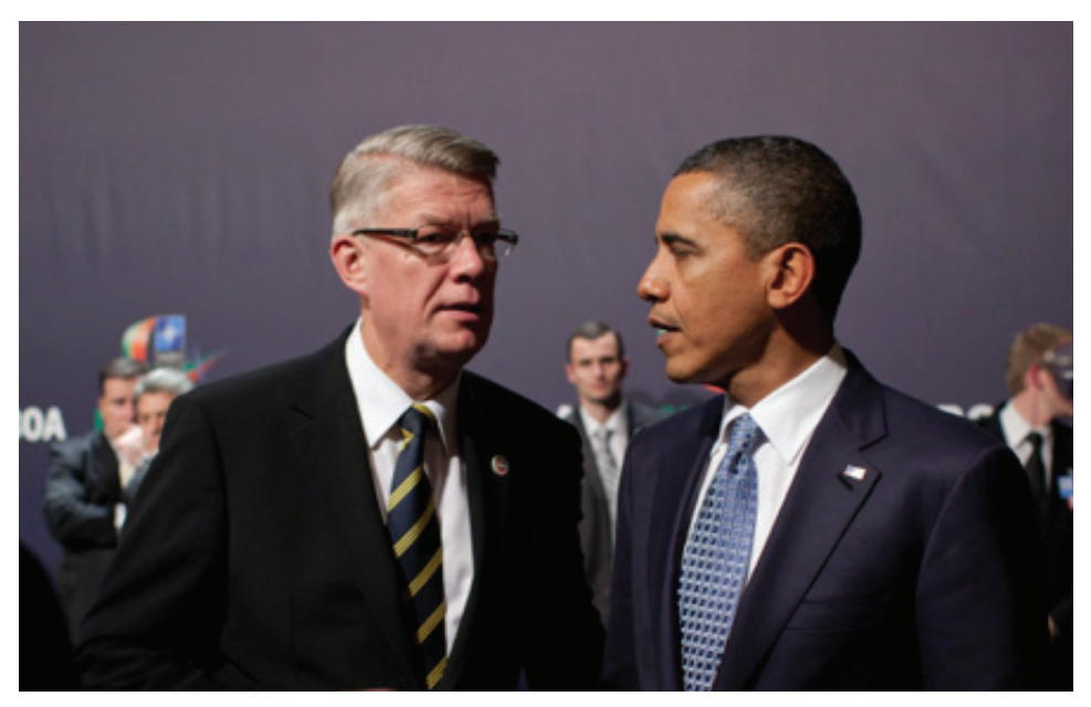
President of Latvia Valdis Zatlers and U.S. President Barack Obama, at the NATO Summit in Lisbon, Portugal. November 19, 2010.