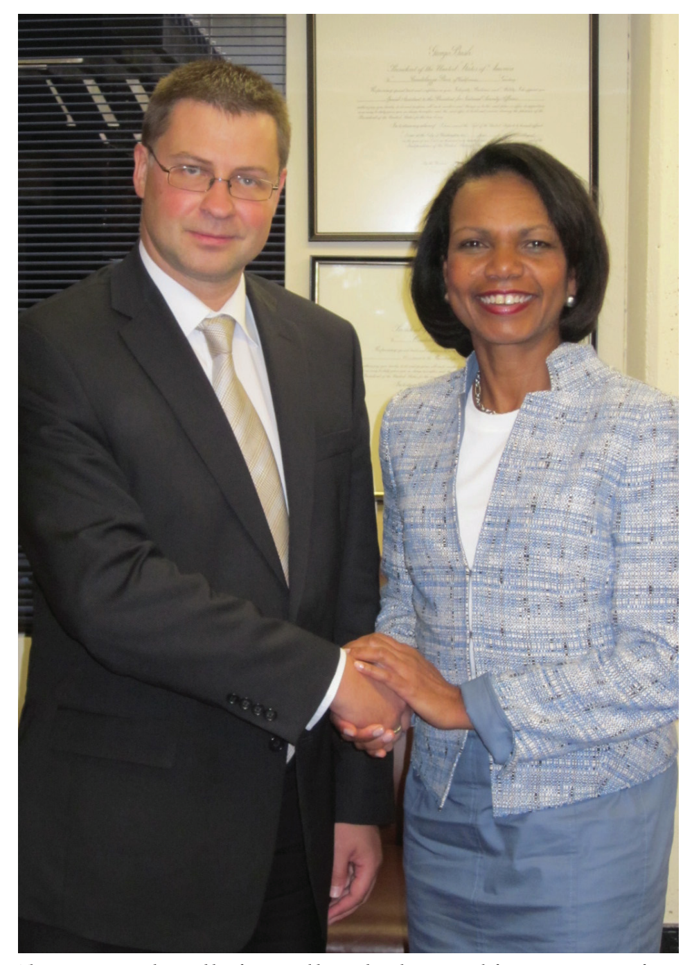
The Prime Minister the Republic of Latvia Valdis Dombrovskis meets with former U.S. Secretary of State Condoleezza Rice, July 16, 2011.