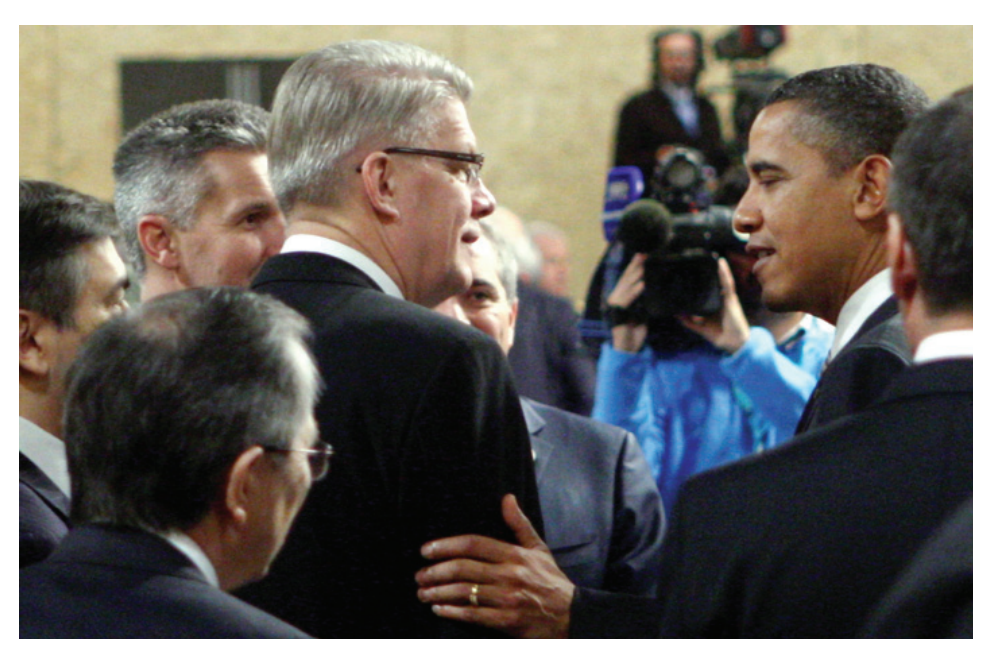
President\ Zatlers\ and\ President\ Obama\ in\ the\ opening\ session\ of\ a\ meeting\ devoted\ to\ Afghanistan\ at\ the\ NATO\ Summit\ in\ Lisbon,\ Portugal,\ November\ 20,\ 2010.