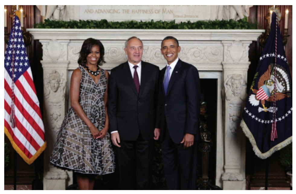
President of Latvia Andris Bērziņš at a reception hosted by U.S. President Barack Obama in honor of the 66th Session of the General Assembly of the United Nations, September 21, 2011.